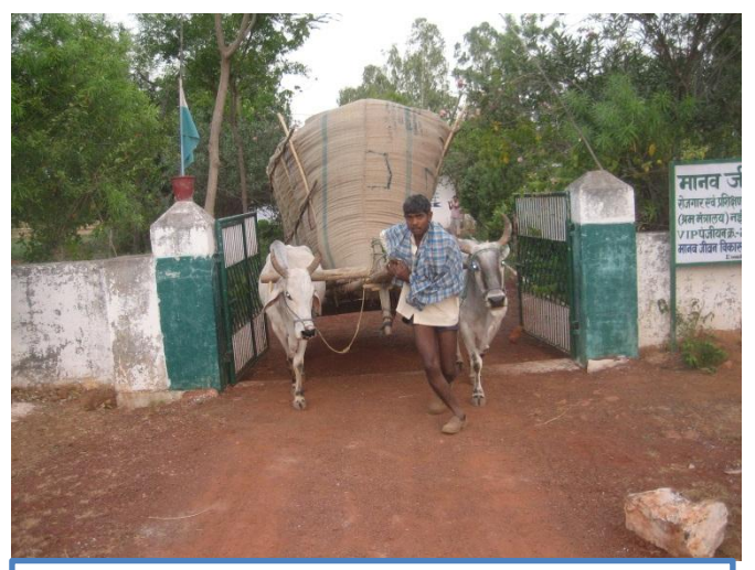
Gandhi was right, when he suggested not investing in too sophisticated technologies as this creates unhealthy dependencies. Villagers with bullock carts are less vulnerable if fuel gets scarce and if energy prices rise.