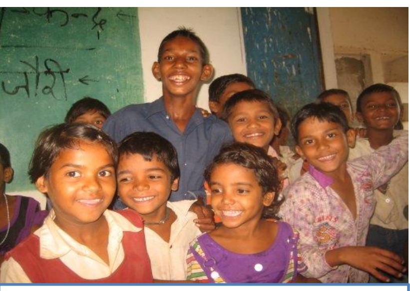
Life quality for all - the main motivation of sustainable development work