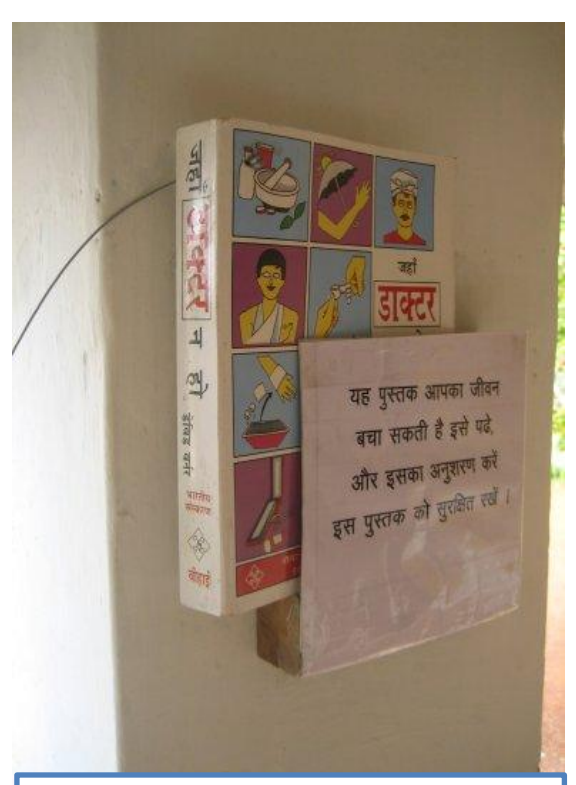
Book "Where there is no doctor" In public places, hospitals, chai shops, ashrams. The access to health information is highly appreciated.

Condom Box (free of cost condoms) The condoms are available in the female and male department of the toilet complex. So a dignified access is guaranteed.