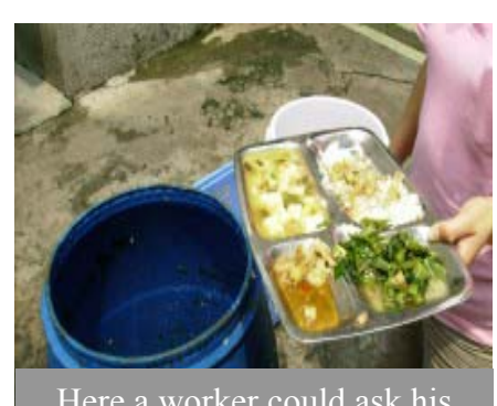
Here a worker could ask his colleague for 1 or 2 Yuan RMB... this helps to reduce greed without cutting needs.

➤ Waste of life-energy: One of the managers tried to explain me, that it is a habit of Chinese to spoil food: "There is no way to correct this". I am sure, that it is possible to reduce this kind of ignorance with wise motivation-methods. Companies can start to inform the workers (on paper and with words), that they (in most of the companies) are paying half of the price of all that plants and animals which are just thrown away. If e.g. a person is throwing away more than ¼ of a plate, this person has to pay 1 RMB into a cash box which belongs to the workers. This controlling mechanism shall not be managed by watchmen. Workers can organize this themselves. The money will be distributed back to the workers e.g. once or