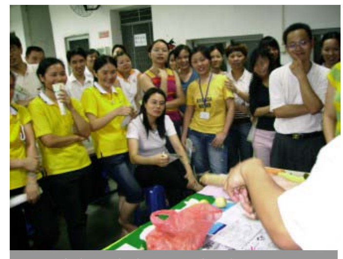
A married men is demonstrating the correct use of the condom (Milos company)

> At least once a year, a gathering shall be organized teaching about and specifically about health Reproductive Health (R.H.). The best moment of informing regarding HIV-protection is just before the lunar New Year holiday, when most of the (migrant) people go home, to visit their families. In this context it is very important, that they know, that without correct condom use, HIV can spread also from husband to wife/ wife to husband. Women empowerment in this context - is very important, because very often, fear from the